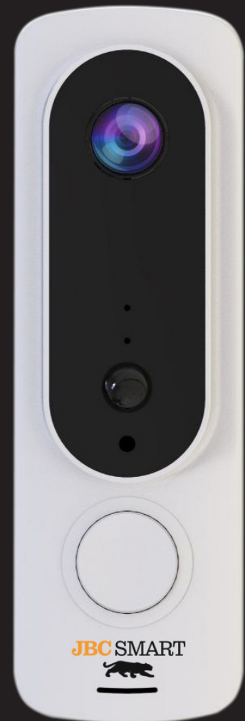
JBC S3 camera.