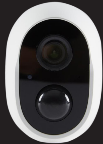
JBC S1 camera.

JBC's main goal is to become the largest supplier of blockchain backed smart devices.